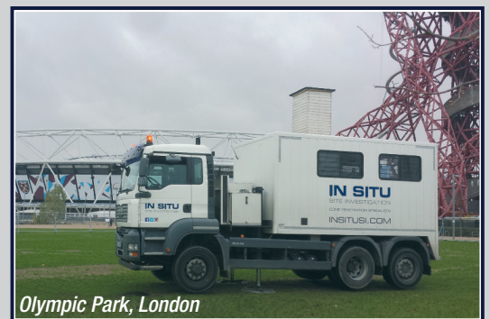
Olympic Park, London